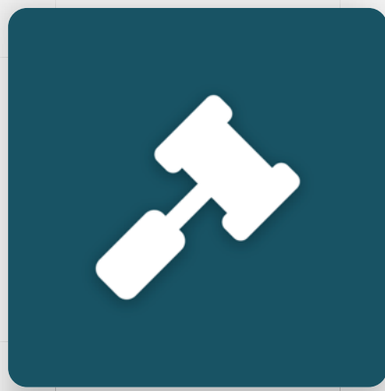
Utah Supreme Court