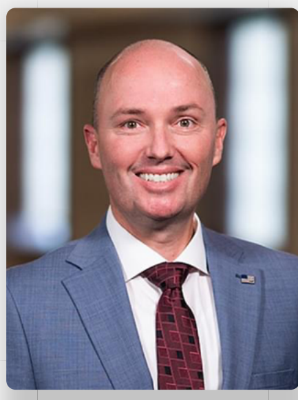
Governor Spencer J. Cox f t y