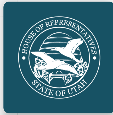
Utah House of Representatives