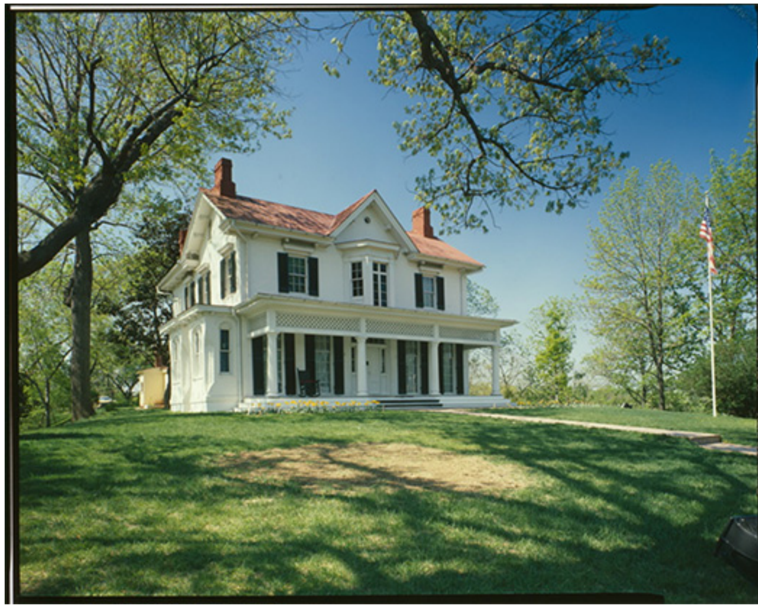
Frederick Douglass House, 1411 W Street, SE...Washington, D.C., 1977.

Address by Hon. Frederick Douglass, delivered in the Congregational Church, Washington, D.C., April 16, 1883. African American Perspectives: Materials Selected from the Rare Book Collection . Rare Book & Special Collections Division