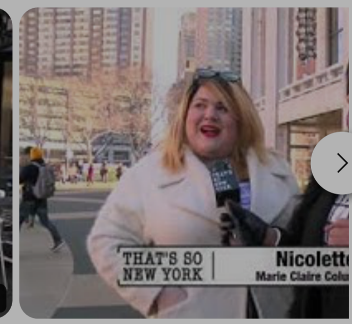
That's So New York: New York Fashion Week 2014 139 views • 9 years ago