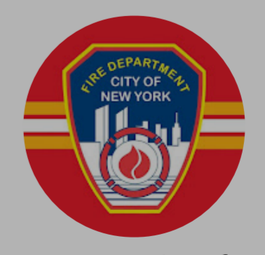
Fire Department, City of New York 29.1K subscribers