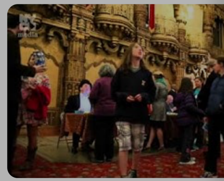
That's So New York: United Palace Theater 10K views • 9 years ago