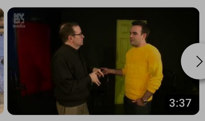
$9.99: Sunday Night Improv 160 views • 9 years ago