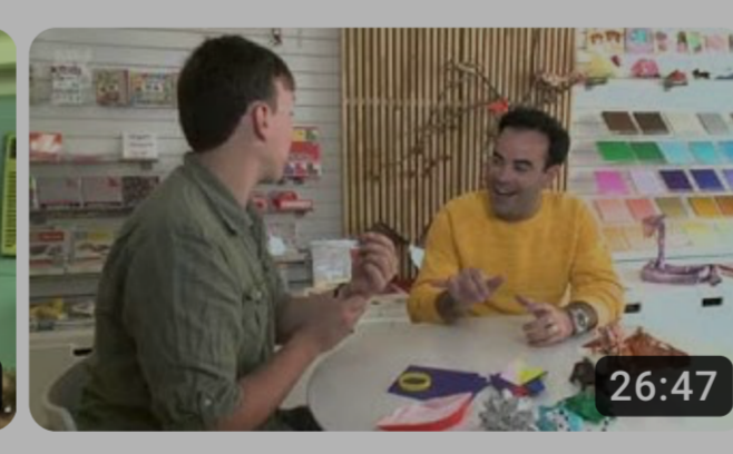
$9.99: Let's Get Crafty 550 views • 9 years ago