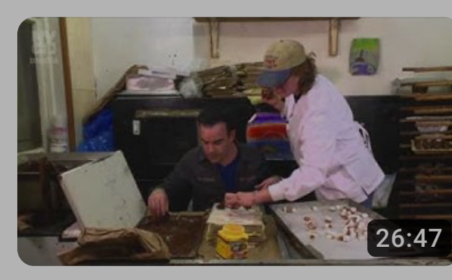
$9.99: It's A Date 1.7K views • 9 years ago