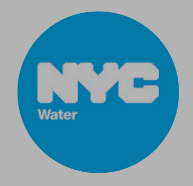
NYC Water 1.56K subscribers