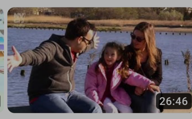
$9.99: Keep Your Kids Busy 651 views • 9 years ago