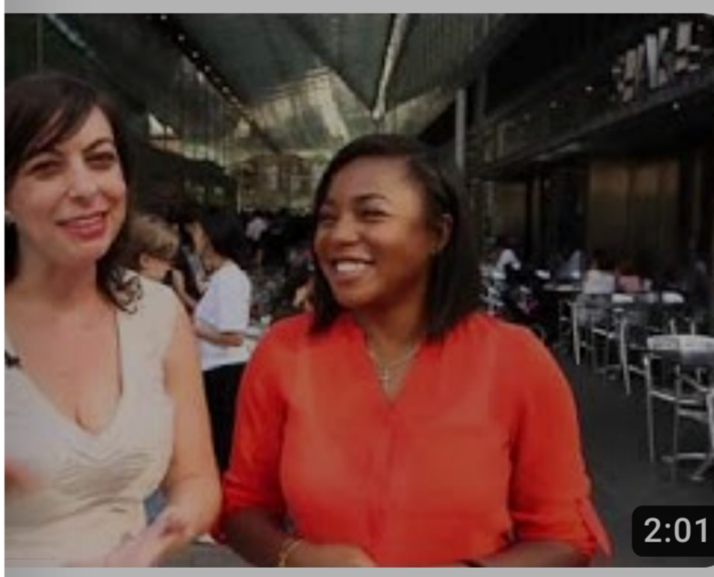
That's So New York: 2014 River to River Festival 138 views • 9 years ago