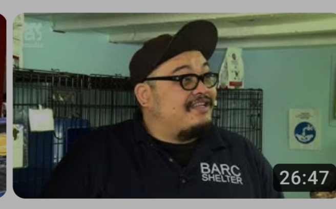
$9.99: Talk To The Animals 316 views • 9 years ago