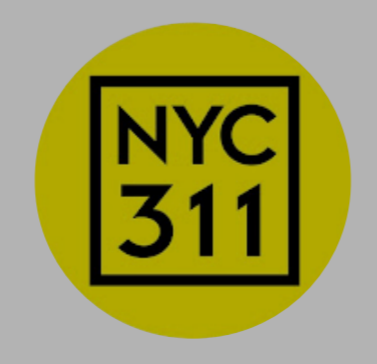
NYC311 997 subscribers