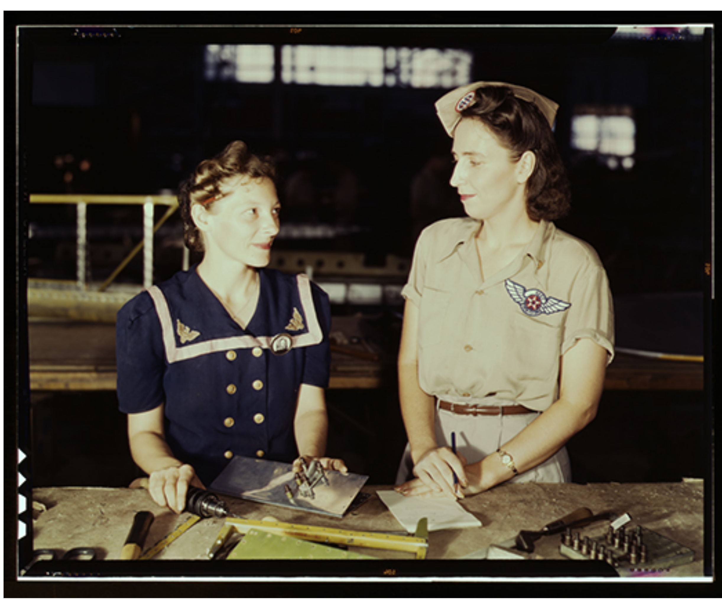
Pearl Harbor Widows...Corpus Christi, Texas.

"This Girl In A Glass House is putting finishing touches on the bombardier nose section of a B-17F navy bomber. She's one of many capable women workers in the Douglas Aircraft Company plant. Better known as the "Flying Fortress," the B-17F is a later model of the B-17, which distinguished itself in action in the South Pacific, over Germany, and elsewhere. It is a long range, high altitude heavy bomber, with a crew of seven to nine men...."