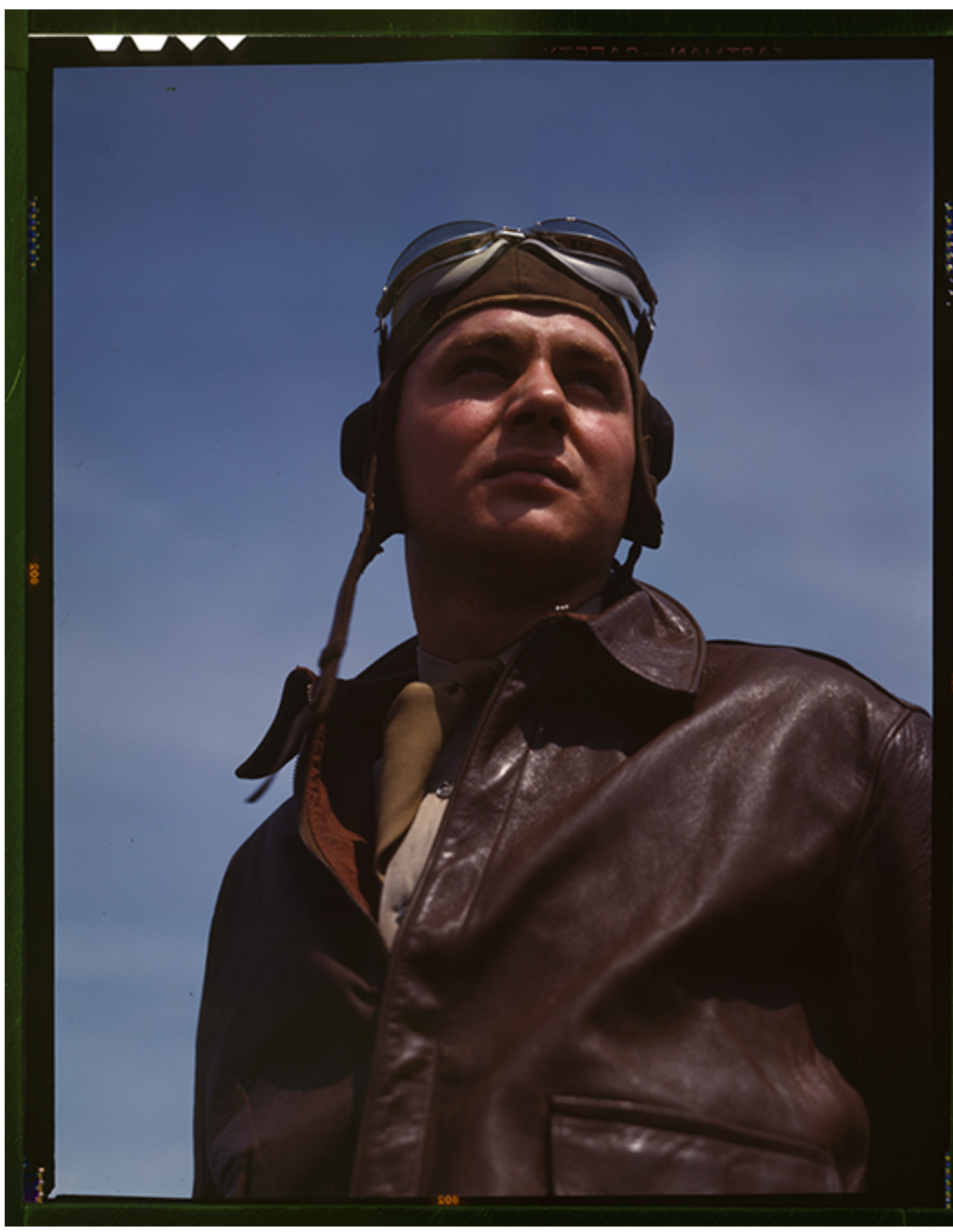
The Kind of Man Hitler Wishes We Didn't Have. A bomber pilot, captain in a bombardment squadron.... Alfred T. Palmer, photographer, May 1942. Farm Security Administration/Office of War Information Color Photographs, Prints & Photographs Division

The OWI served as an important U.S. government propaganda agency during World War II. It documented America's mobilization for the war effort in films, texts, photographs, radio programs, and posters. OWI photographers documented American life and culture during the early years of World War II, focusing on such subjects as training for war work, the increasing numbers of women in the workforce, and civil rights struggles—including the internment of Japanese Americans, and the movement to enable the increased participation of African American soldiers in the U.S. armed forces.