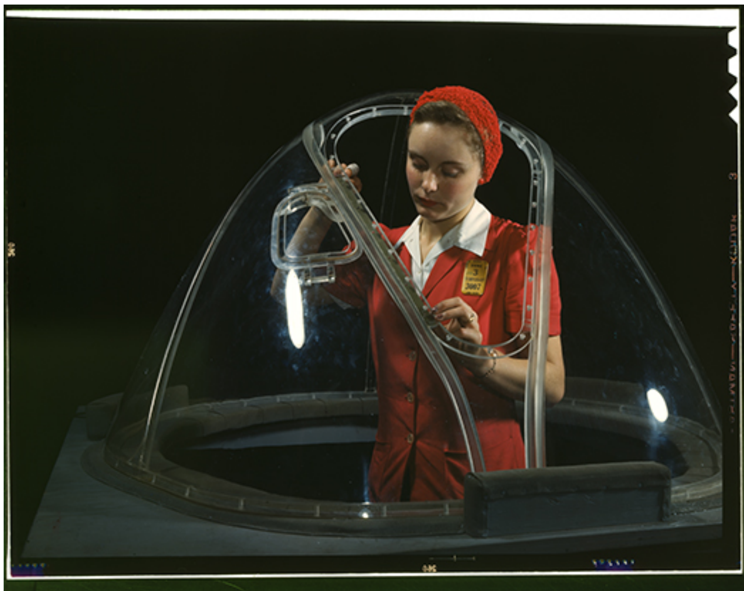
Girl In A Glass House...Long Beach, Calif.

"This Girl In A Glass House is putting finishing touches on the bombardier nose section of a B-17F navy bomber. She's one of many capable women workers in the Douglas Aircraft Company plant. Better known as the "Flying Fortress," the B-17F is a later model of the B-17, which distinguished itself in action in the South Pacific, over Germany, and elsewhere. It is a long range, high altitude heavy bomber, with a crew of seven to nine men...."